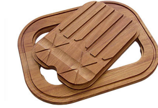
Iroko-wood twin chopping board 8644 003